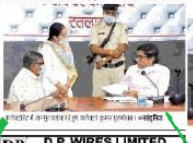
स्कूल फीस माफ करवाई, रेडक्रास से दी मदद...