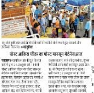
प्याज और सोयाबीन की कीमतें...