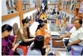
दीपोत्सव के अवसर पर रतलाम के बाजारों में खरीदी का महामुहूर्त कल...