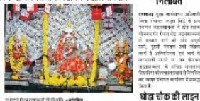
महालक्ष्मी मंदिर दानपात्र में आए 2.18 लाख...