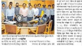
इंजन मेटेनेंस में रतलाम डीजल शोड पहले नंबर पर...