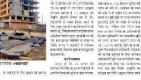
कलेक्टर के अदालत पर निगम से भी निगम अनुमति रद हो चुकी है...