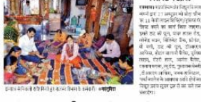
पोडा चोक की राह शिपिंग अड्डे का निर्माण...