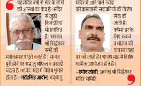
श्रावण माह में सिद्धार महादेव मंदिर, वडवाली

निरशुल्क अन्न क्षेत्र पर सात मंदिर में निर्माणाधीन सात मंदिरों की शुरुआत के लिए निरशुल्क अन्न की व्यवस्था होगी। इनके अलावा अन्न की व्यवस्था मंदिर में रखी जायेगी। मंदिर में निरशुल्क अन्न की व्यवस्था करने के लिए निरशुल्क अन्न की व्यवस्था होगी।